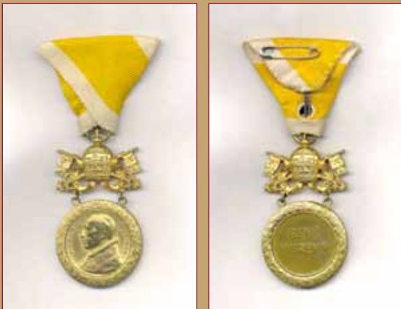
Benemerenti medal in the collection of the Thomas P. Fay, S.J., Archives of the Society of Jesus of New England, College of the Holy Cross, Worcester, MA